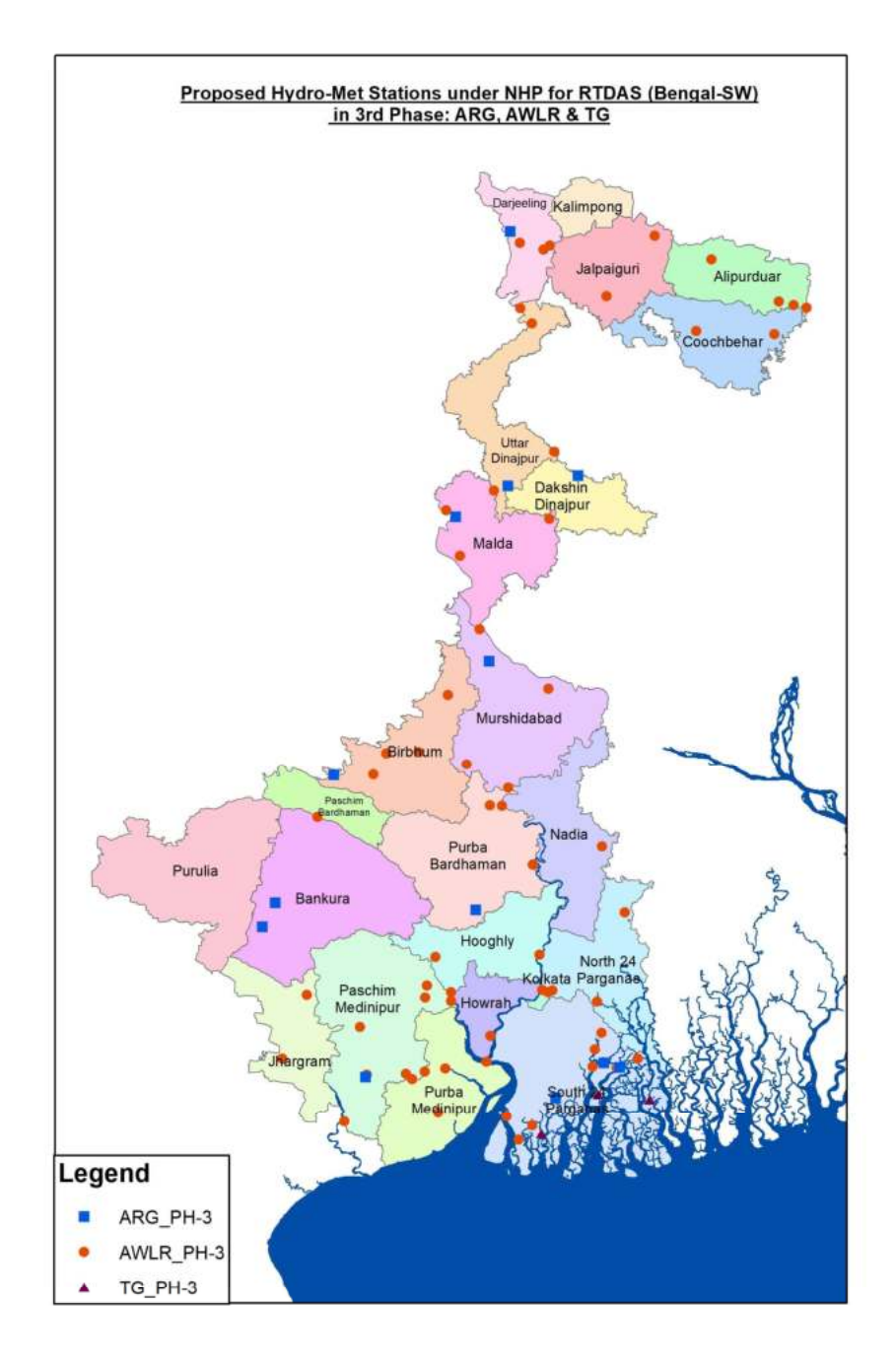
Fig 1: Location of Proposed RTDAS stations